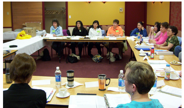
Attendees of the DOT Finance Officer and Administrative Assistant Professional Development day in Yellowknife